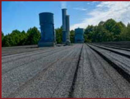
MR Multi-Ply® Roof System