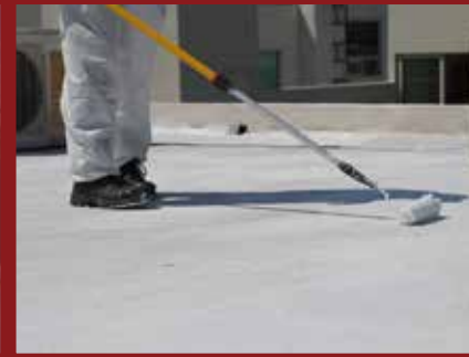
Water Based Coatings